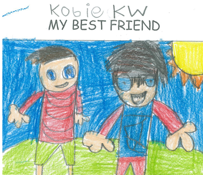
Student Artwork this week by