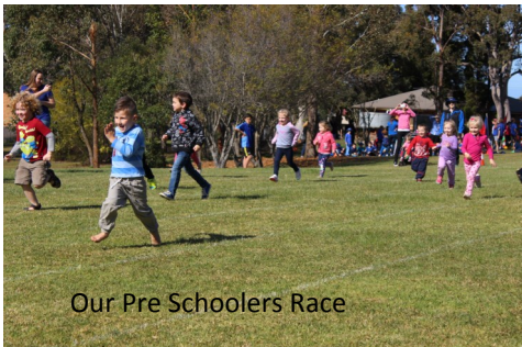
Our Pre Schoolers Race