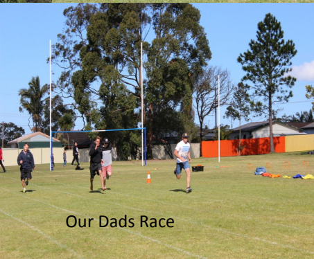
Our Dads Race