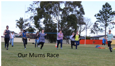
Our Mums Race